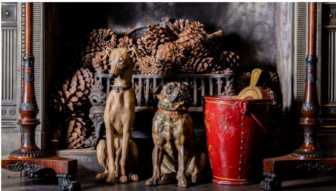
Image: In these cool months, warm your body and your mind with a tour of Fermoy House.