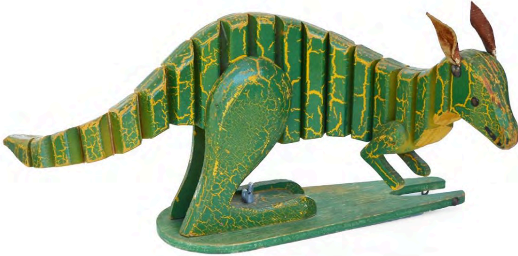
Image: Winkie Toys Kangaroo , early 1930s, wood, paint, leather. The Luke Jones Collection.