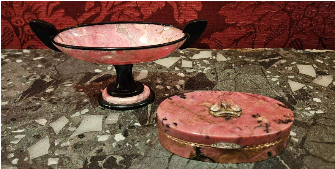
Image: Unknown lapidarist Tazza 1920-40 Rhodochrosite, onyx; Karl Hahn Snuff box c. 1895 Rhodonite, diamonds, gold. The David Roche Collection.

David Roche collected a beautiful selection of hardstones, many of which are incorporated into objects d'art and can be seen throughout Fermoy House. Two striking pink stones that you can see on a tour of the house are Rhodonite and Rhodochrosite.