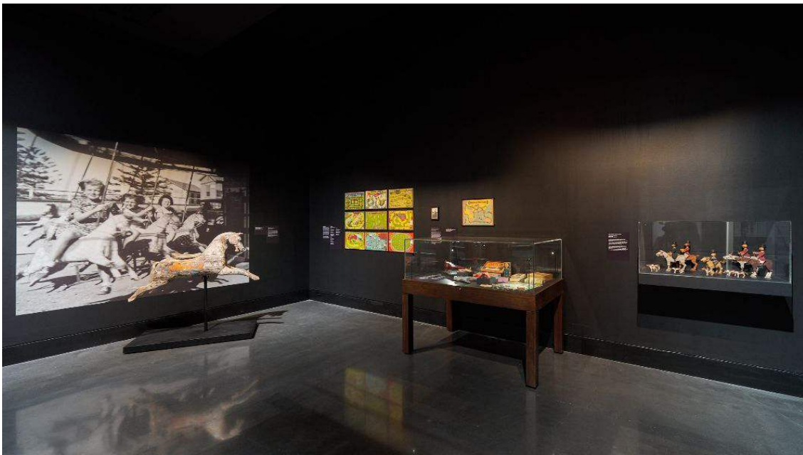
Image: Be among the first to relish the nostalgia in our new exhibition Australian Toys 1880–1965 . Come today!