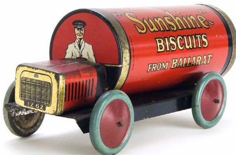
Image: Leckie and Gray Sunshine Biscuits from Ballarat truck 1930s, tinplate; lithography. The Luke Jones Collection.