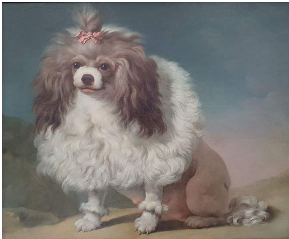
Image: attributed to Jean-Jacques Bachelier (France, 1742-1806), Portrait of a dog (possibly a Löwchen) c. 1790, oil on canvas. TDRF 1371.