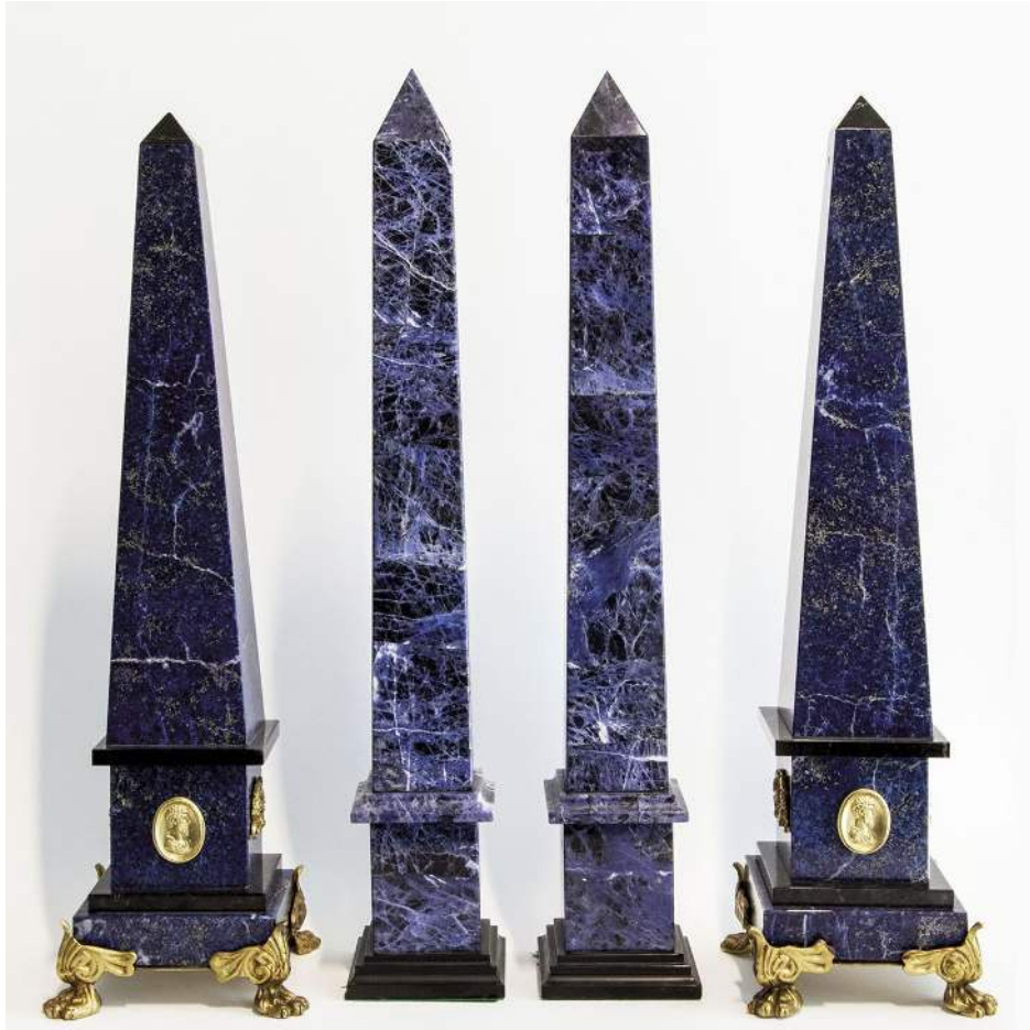
Image: Unknown lapidarists, Obelisks , Lapis Lazuli and ormolu mounts (outer); Sodalite and black marble (inner). TDRF 2678, 1432.

Showcasing the favourite pieces of our volunteers in The David Roche Collection. In this edition, Ian S looks at two pairs of handsome obelisks.