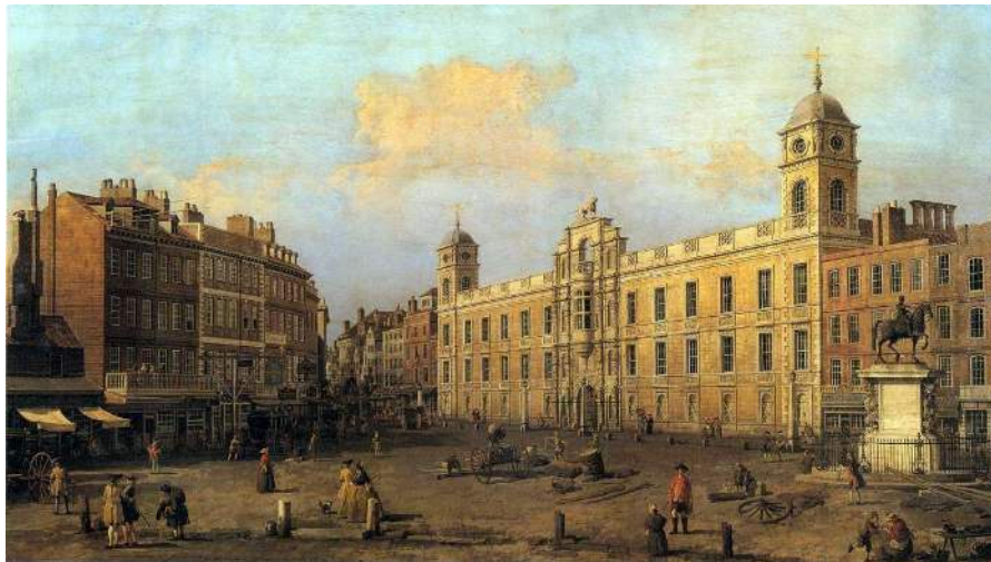
Image: Giovanni Antonio Canal, known as Canaletto, Northumberland House, Strand 1752 . Alnwick Castle Collection, Northumberland.