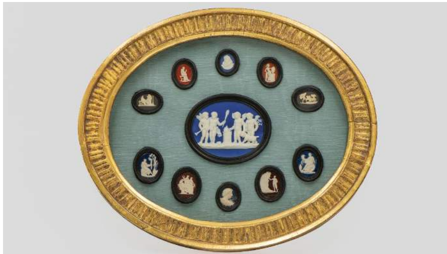
Image: Wedgwood (Britain established 1759), Neoclassical medallions 1770s, jasper, polychrome enamel, mounted and framed. TDRF 2822.