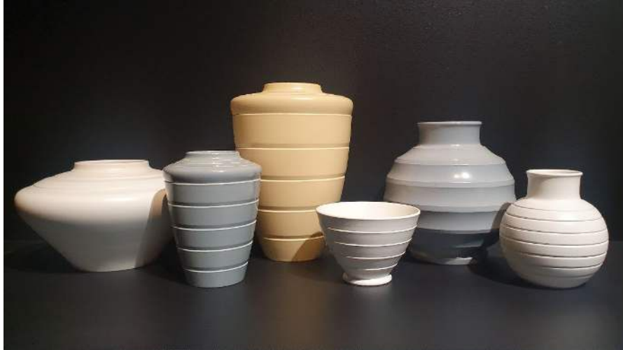
Image: Keith Murray's vases are famed for their modern elegance. See them now in Wedgwood: Master Potter to the Universe .