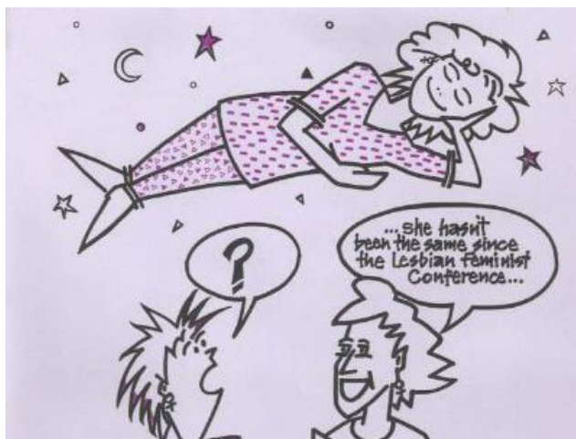
Image: National Lesbian Feminist Conference & Celebration, Adelaide 1989 (detail).