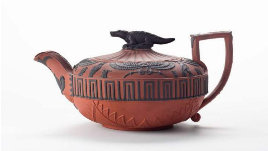
Image: Wedgwood (Britain, established 1759), Teapot c. 1810, Rosso antico stoneware, black bassalt stoneware sprigging.

In 1769, Josiah Wedgwood famously declared his intention to become 'Vase Maker General to the Universe'. Experimentation and innovation brought Wedgwood's name and product into homes worldwide, and continue to be the defining features of this internationally celebrated ceramic manufacturer.