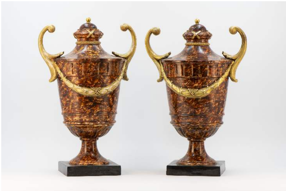
Image: Wedgwood & Bentley (Britain 1769-1780), Pair of vases and covers c. 1780, white terracotta, polychrome enamel imitating marble, gilding. TDRF 2567.