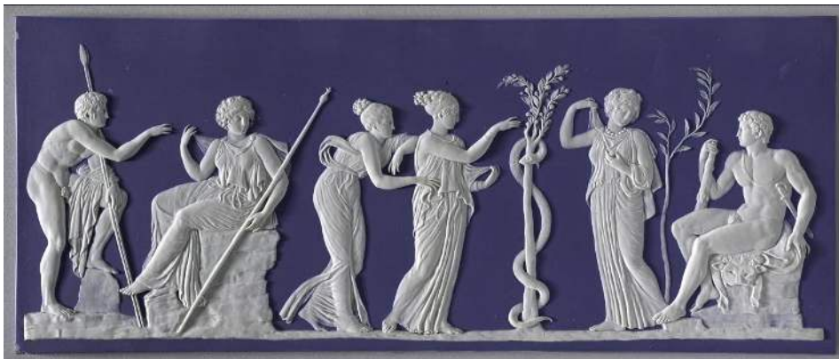
Image: Wedgwood (Britain established 1759); John Flaxman Jr (Britain 1755–1826), modeller, Hercules in the garden of Hesperides 1785–1800, white on blue jasper. National Gallery of Victoria. Purchased 1877