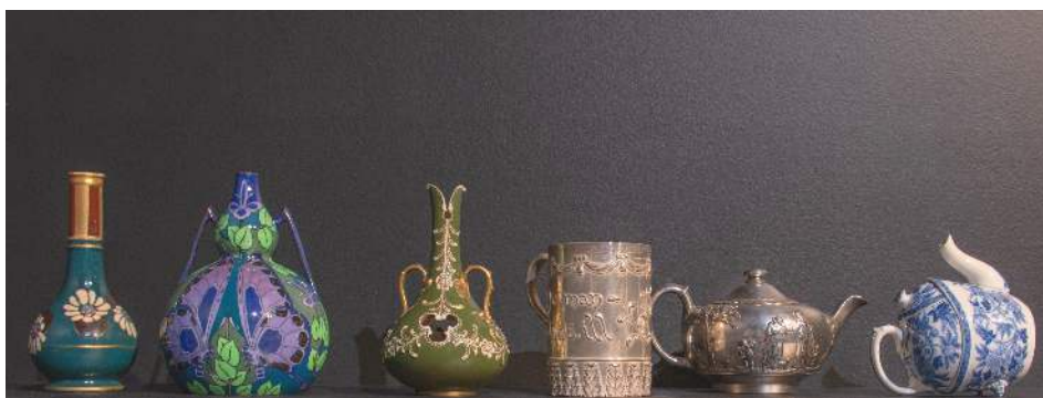
Image: See Wedgwood unlike any that you've seen before in our new exhibition Wedgwood: Master Potter to the Universe