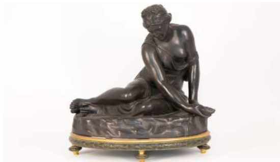
Image: Wedgwood (Britain, established 1759), Nymph at Well c. 1870, black basalt stoneware. TDRF 2365

In 1769, Josiah Wedgwood famously declared his intention to become 'Vase Maker General to the Universe'. Experimentation and innovation brought Wedgwood's name and product into homes worldwide, and continue to be the defining features of this internationally celebrated ceramic manufacturer.