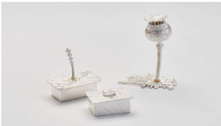
Image: Regine Schwarzer Banksia container 2023 , Pill container 2023 , Papaver somniferum container 2023 .