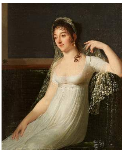
Image: Robert Jacques François Lefèvre (France 1755-1830), Bernardine Eugénie Désirée Clary c. 1798. Oil on canvas, TDRF 1427.