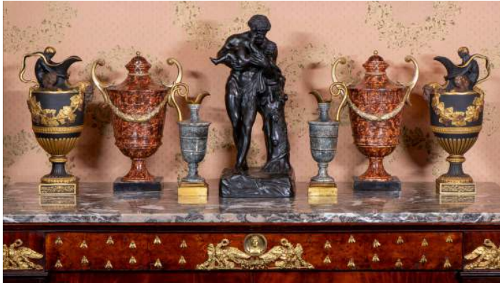
Image: Explore nearly 265 years of artistry in our upcoming exhibition Wedgwood: Master Potter to the Universe