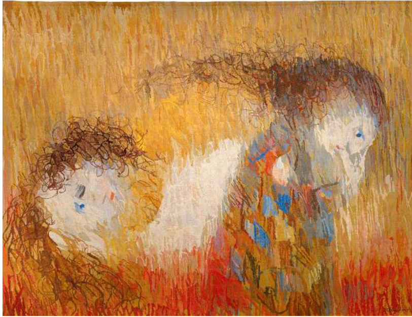
Image: Arthur Boyd (designer), Tapeçarias de Portalegre (manufacturer), St Francis when young turning aside 1972. High warp tapestry. Collection: National Gallery of Australia, purchased 1975. Arthur Boyd's work reproduced with the permission of Bundanon Trust.

Celebrated Australian artist Arthur Boyd and his vision of the endearing medieval Italian saint, St. Francis of Assisi, comes to Adelaide from the collection of the National Gallery of Australia.