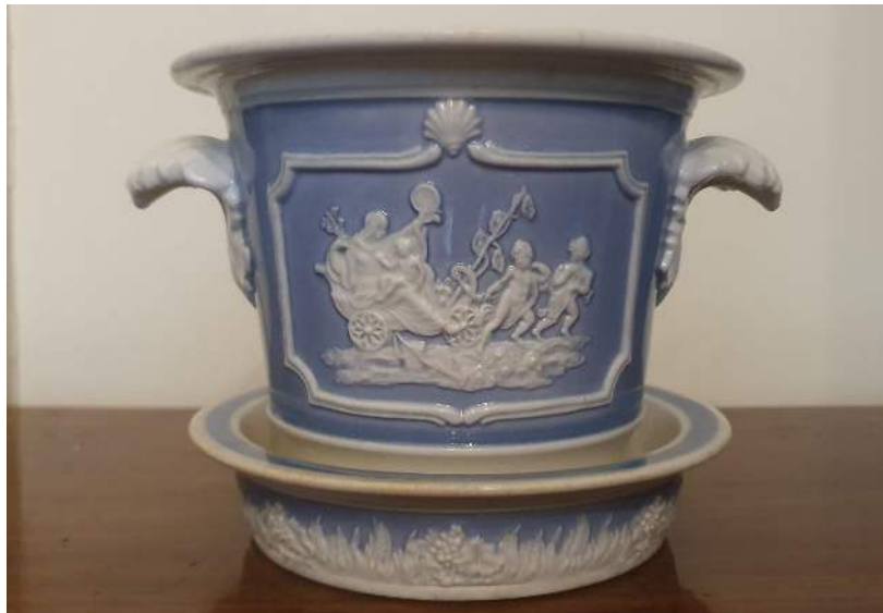
Image: Job Ridgway & Sons (Britain, 1808-1813) Cachepot c. 1810. Porcelain, glazed. TDRF 3887.