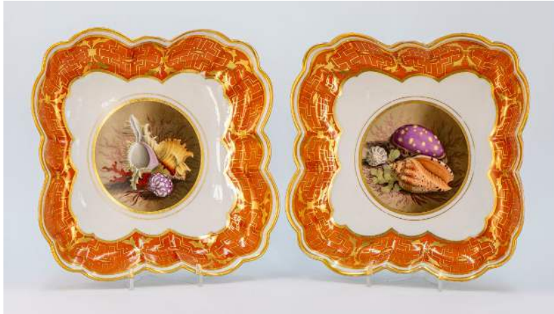
Image: Worcester Porcelain Factory (Flight, Barr & Barr), Pair of dishes c. 1810. Porcelain, polychrome enamel, glazed, gilding. TDRF 1707.

Showcasing the favourite pieces of our volunteers in The David Roche Collection. In this edition, Leslie S writes about a pair of richly decorated porcelain dishes displayed in the Main Bedroom at Fermoy House.