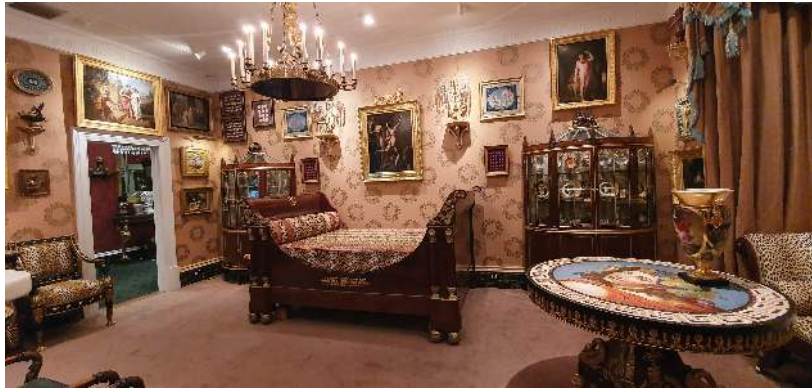
Image: The Main Bedroom in Fermoys House looks better than ever with a lighting upgrade that enhances the ambience of the room and collections within.