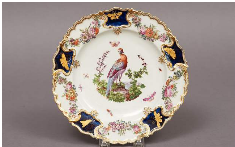
Image: Chelsea Porcelain Factory, Plate from the Mecklenburg-Strelitz service 1762. Soft-paste porcelain, polychrome enamel, gilding. TDRF 1924.

Showcasing the favourite pieces of our volunteers in The David Roche Collection. In this edition, Geoff S introduces a plate from a significant Chelsea Porcelain service.