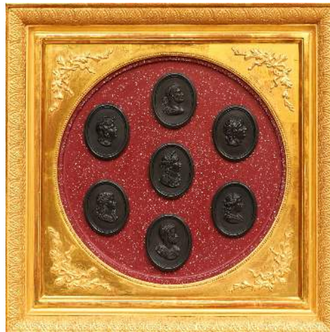
Image: Wedgwood Factory, Set of seven cameos c. 1820. Black basalt earthenware. TDRF 1434