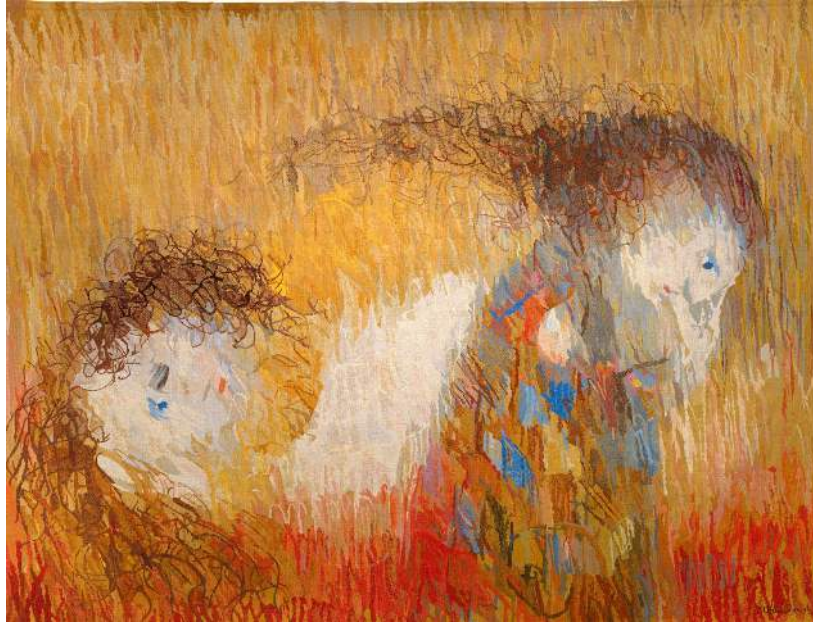
Image: Arthur Boyd (designer), Tapeçarias de Portalegre (manufacturer), St Francis when young turning aside 1972. High warp tapestry. Collection: National Gallery of Australia, purchased 1975. Arthur Boyd's work reproduced with the permission of Bundanon Trust.