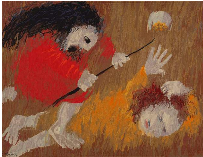
Image: Arthur Boyd (designer), Tapeçarias de Portalegre (manufacturer), St Francis being beaten by his father 1973. High warp tapestry. Collection: National Gallery of Australia, purchased 1975. Arthur Boyd's work reproduced with the permission of Bundanon Trust.