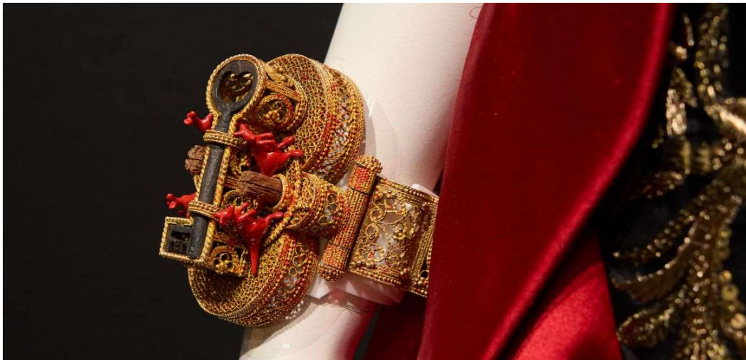
Image: Bracelet, 'Java-la-Grande. India, Goa, Indo-Portuguese, circa second quarter of the 16th century (?)' by Robert Baines, 2004-05. Powerhouse Museum, purchased with funds from the Yasuko Myer bequest, 2011.