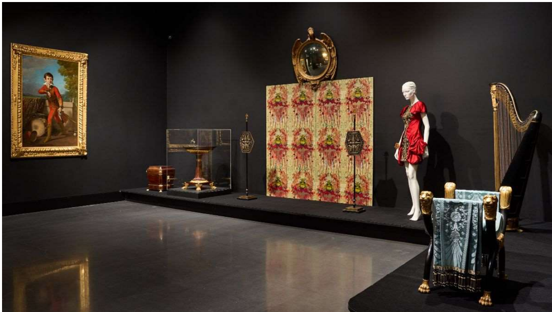
Image: Fantastical Worlds installation view, August 2022.