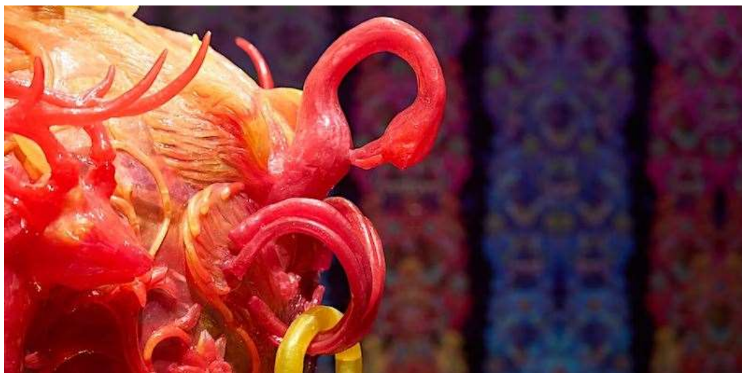
Image: Kate Rohde, Deer vase (detail) 2016. Powerhouse collection, purchased 2017.

Learn more about the pieces in Fantastical Worlds by joining a tour led by one of our passionate volunteers. Tours take place each Friday at 11.15AM, and are free with your exhibition ticket. Numbers are limited, so be sure to book to reserve your place!