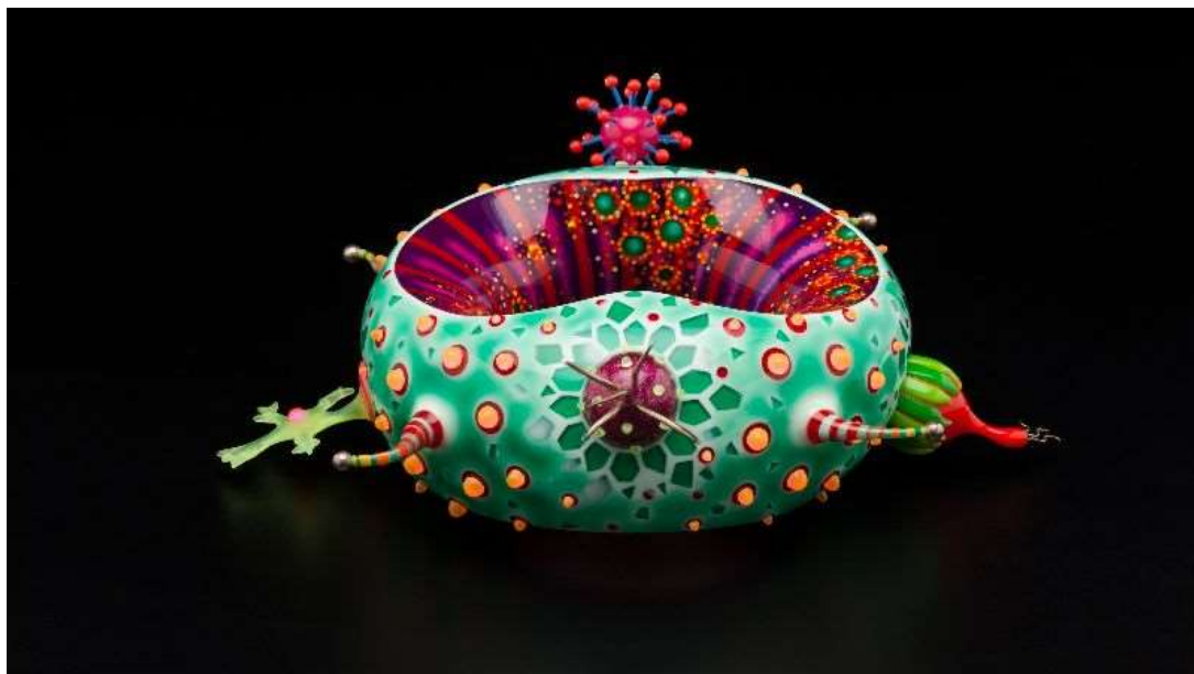
Image: Peter Chang, Bracelet , plastics and silver, Scotland, 2004. Powerhouse collection, purchased 2005.