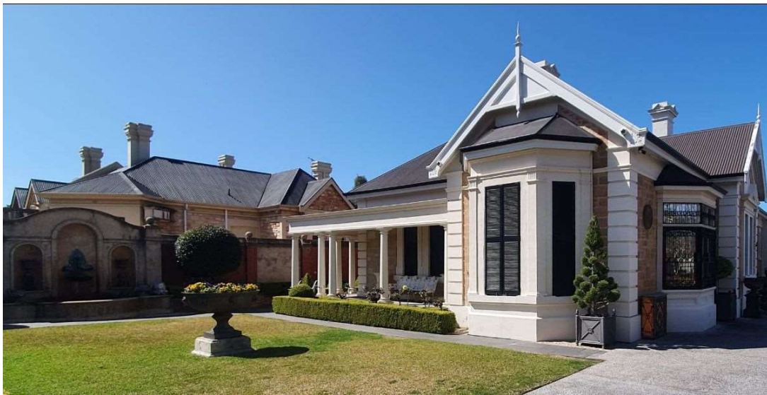
Image: The sun is shining and the flowers are blooming every spring morning at Fermoy House