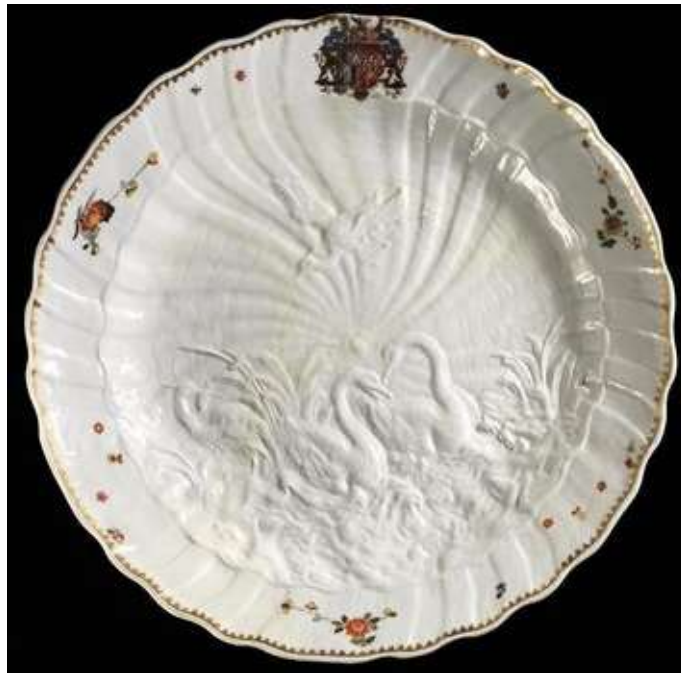
Image: Meissen Porcelain Manufactory (Germany established 1710), Johann Joachim Kaendler (German 1706–1775), modeller, Dish (from the Swan Service) c. 1738, hard-paste porcelain, polychrome enamel, gilt. (TDRF 2473)