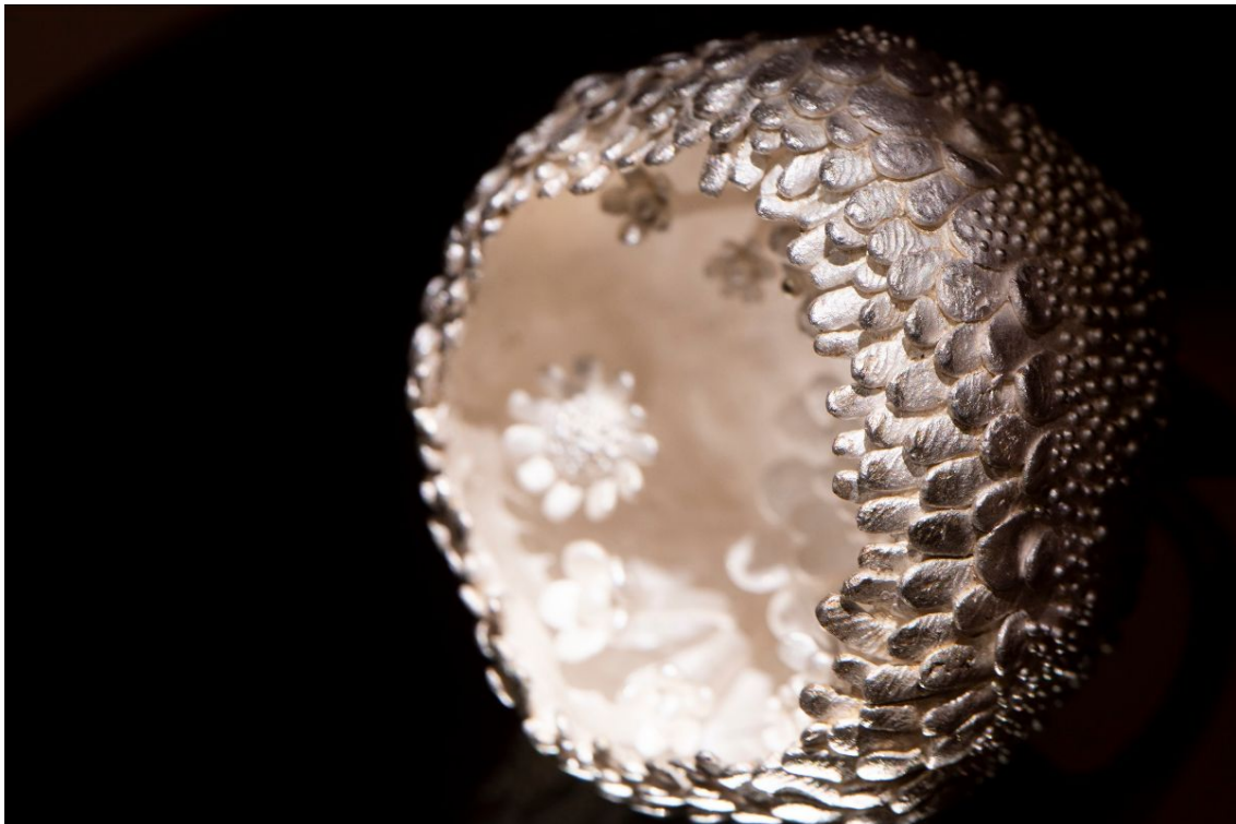
Image: Nora Rochel, Ring , fair trade silver, Germany, 2013. Powerhouse collection, purchased with funds from the Yasuko Myer Bequest, 2013. This jewel and other exquisite works of art, decorative art, and fashion will be displayed in Fantastical Worlds , opening 13 August 2022.

A wealth of events are planned for our upcoming exhibition Fantastical Worlds . Mark them in your diary now, and keep an eye out for your invitation when we release tickets!