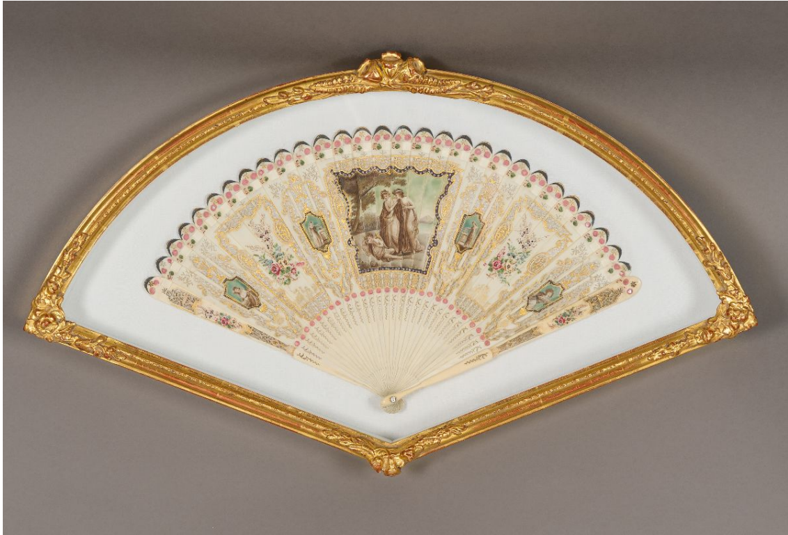
Image: Britain, Ivory brisé fan with painted scene after Angelica Kauffman, formerly owned by Her Royal Highness, The Princess Margaret, Countess of Snowdon (TDRF 2591)