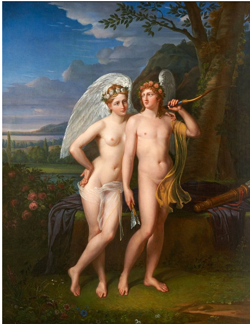
Image: Robert Jacques François LeFèvre (1755-1830), Psyche and Cupid c. 1800 (TDRF 2639)

This painting in the David Roche collection by the French artist Robert LeFèvre (1755 – 1830) depicts an ancient mythological scene with two figures in a garden. Cupid (Eros in Greek) son of Venus (Aphrodite in Greek) representing divine Love, is leading Psyche, representing the human Soul, through the garden. These lovers are in fact about to be newly wed.