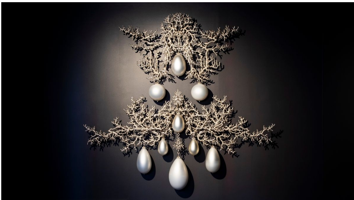
Image: Timothy Horn, Gorgonia 15 , nickel-plated bronze and mirrored blown glass, USA, 2018. Powerhouse collection, purchased with funds from the Barry Willoughby Bequest, 2018. In Fantastical Worlds , opening 13 August 2022.