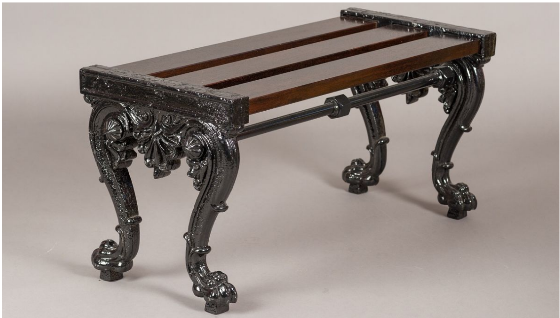
Image: Top Left: Her Royal Highness, The Princess Margaret in 1951, wearing a Christian Dior gown, photographed by Cecil Beaton. Top Right: Folco Romanelli Foundry, Florence, after the Apollo Belvedere 2000, bronze, gilt (TDRF 2923). Bottom: Britain, Bench standards c.1830, cast iron, wood (TDRF 2174).