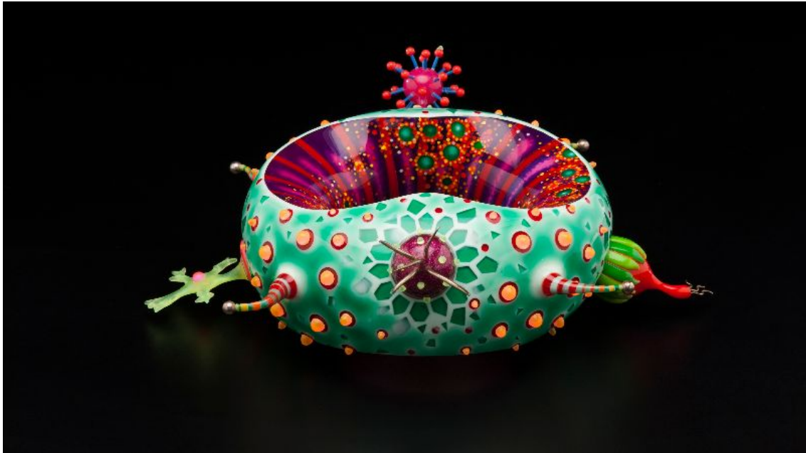
Image: Peter Chang, bracelet, plastics and silver, Scotland, 2004. Powerhouse collection, purchased 2005.