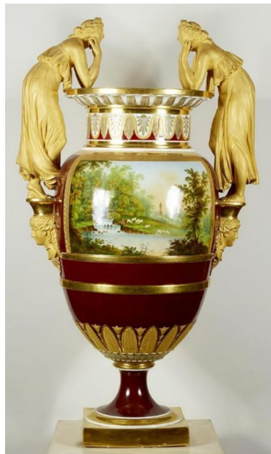
Images: Top - two urn vases on display in the Gallery at Pavlovsk Palace, St Petersburg. Lower left - urn vase, collection: Pavlovsk Palace. Lower right - Imperial Porcelain Factory (manufacturer), Jean Démosthène Dugourc (designer), Ivan Chesky (painter), Vase 'Gossips' c.1807, collection: Hermitage Museum, St Petersburg.