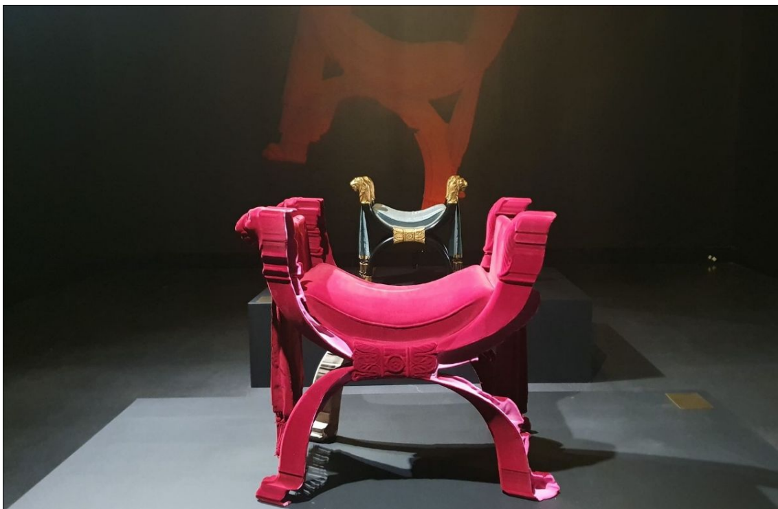
Image: X-Frame Stool , designed by Thomas Hope 1810-15 and Zombie - Manticorus 3D print and video by Rochus Hinkel 2022, displayed in our exhibition Doppelgänger and Zombies , open until 23 July 2022.