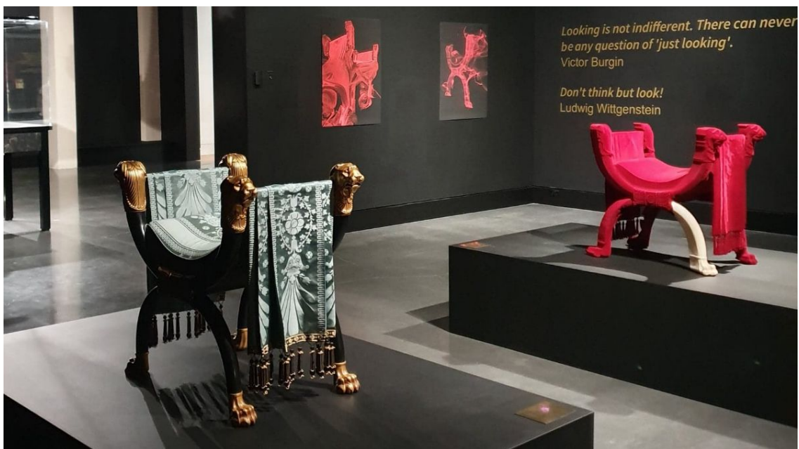
Image: Installation view, Doppelgänger and Zombies , The David Roche Foundation

To celebrate the exhibition Doppelgänger and Zombies , several events are planned on Friday 22nd and Saturday 23rd July.