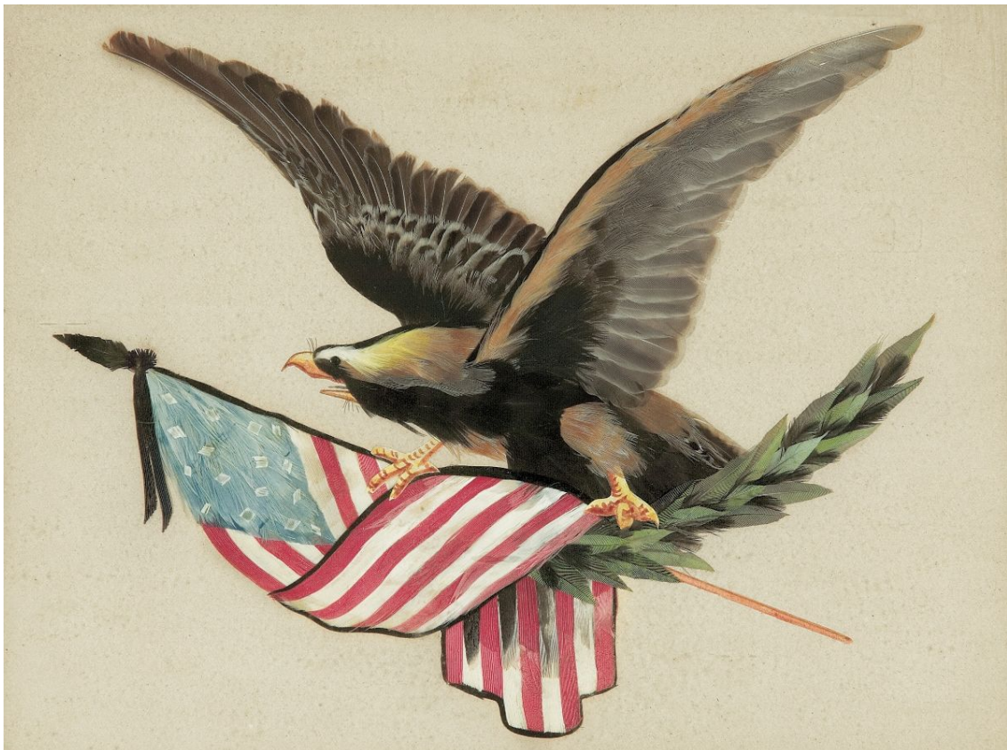
Image: United States of America, eagle feather picture c.1860. TDRF Reg 2587

In a nod to our American friends who celebrated Independence Day on 4 July, we look into the archives at this delicately composed picture of a bald eagle holding the United States Flag and an olive branch of peace, created from feathers in themed-nineteenth century.