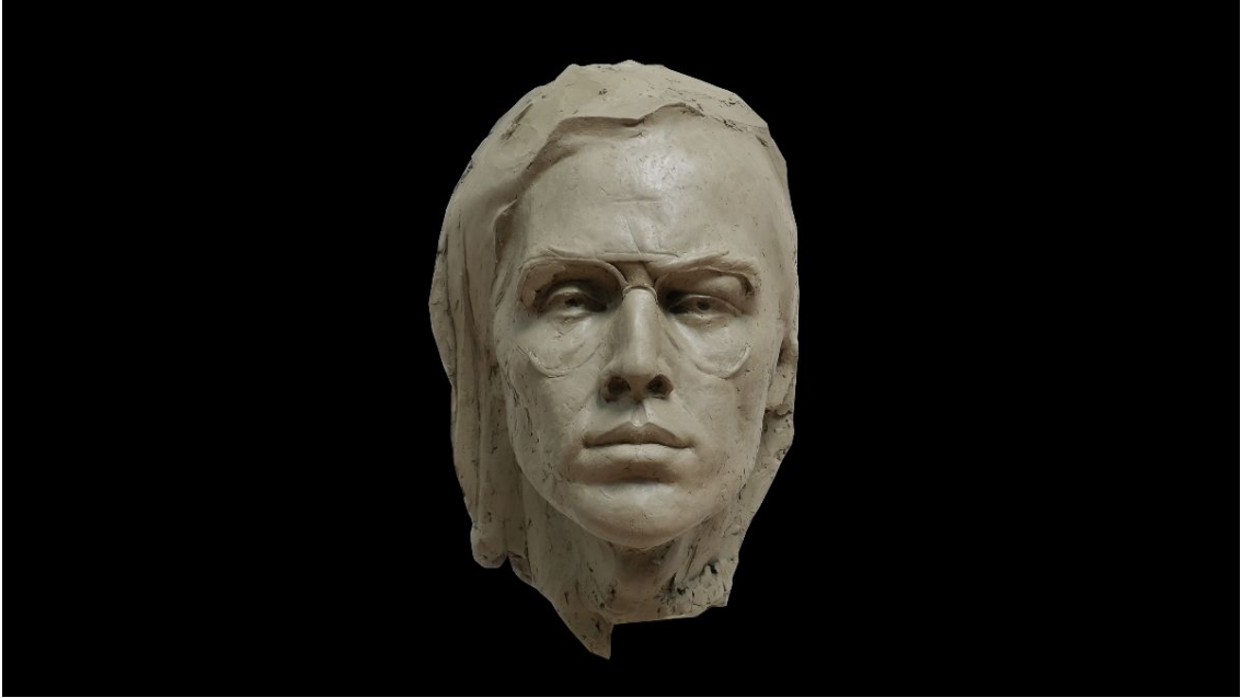
Image: Georgina Mills, I look at and see through you 2020, clay, ed. of 4