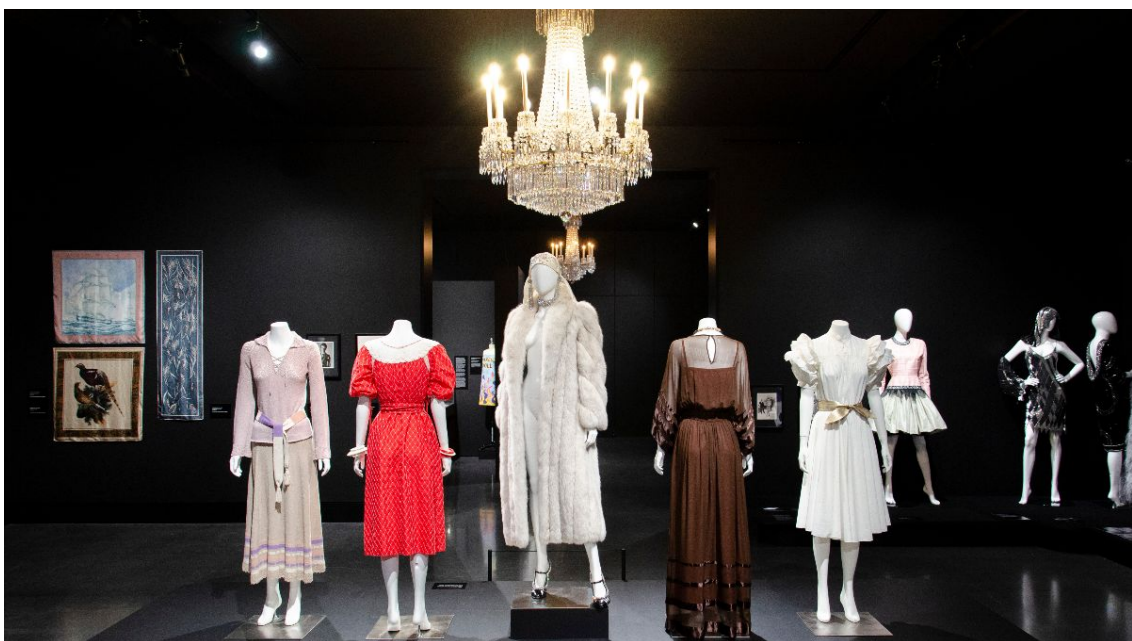
Image: Fashion by Giorgio di Sant'Angelo in Silhouettes: Fashion in the Shadow of HIV/AIDS .