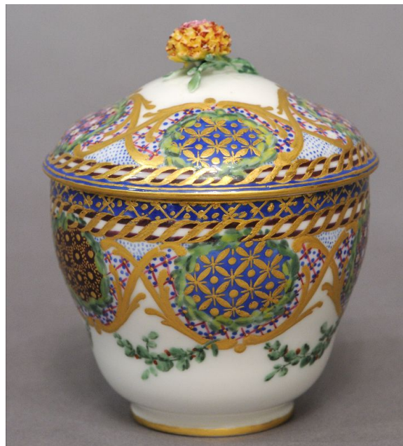
Image: Sèvres Porcelain Manufactory, Sugar pot and cover (pot à sucre Hébert) , c.1775. TDRF Reg. 2423.