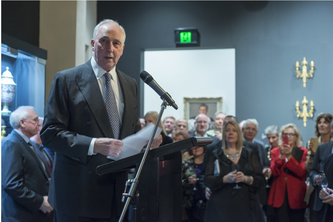
Image: The Hon. Paul Keating officially opening the museum in June 2016.