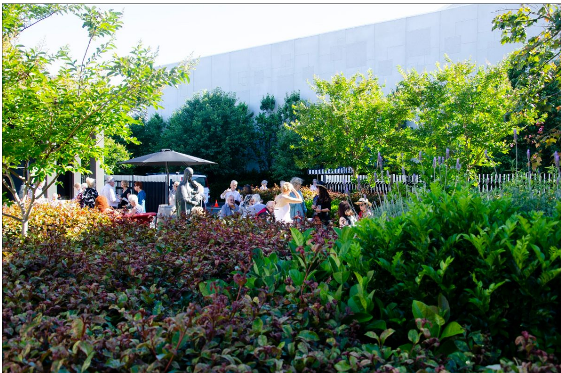
Image: A view to our front courtyard garden.