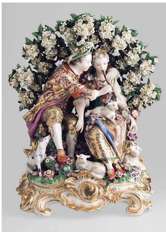
Image: Chelsea Porcelain Music Lesson.1765.