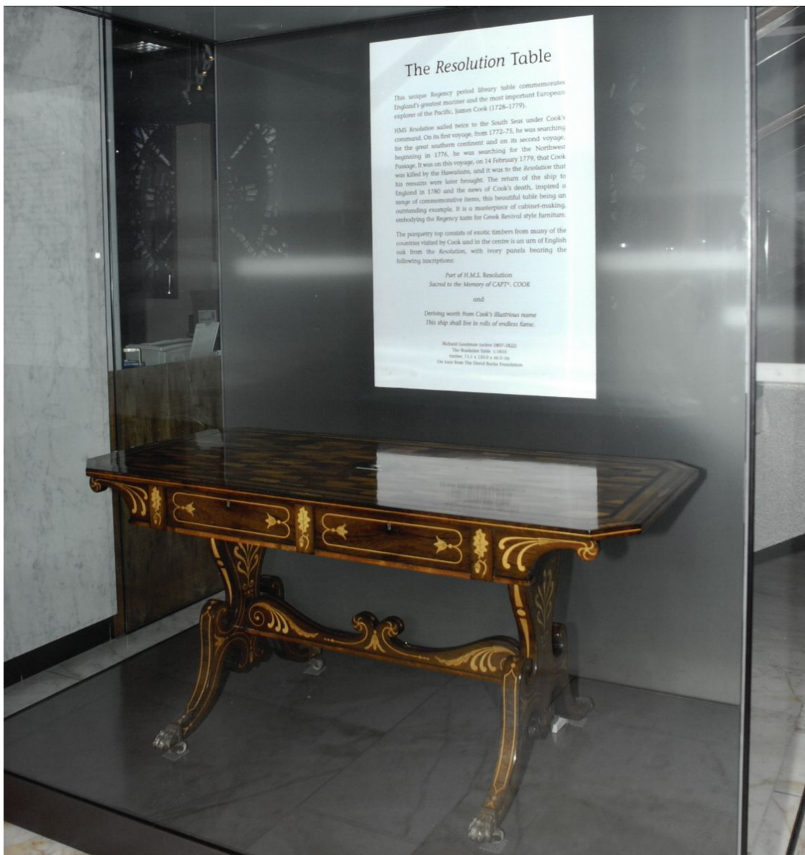
Image: The HMS Resolution Table on loan to the National Library of Australia.