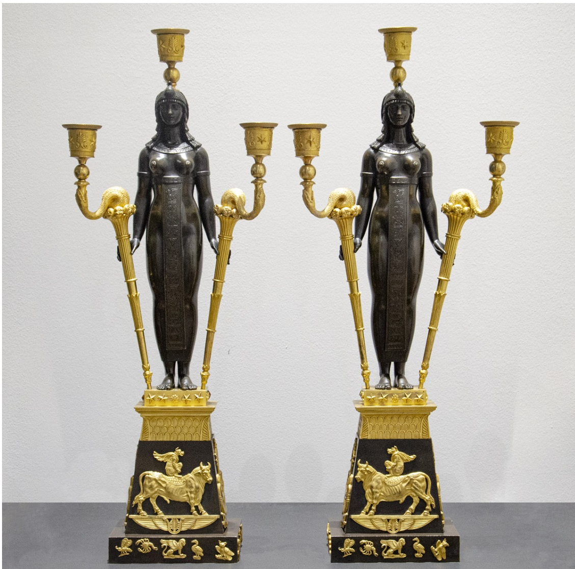
attributed to Pierre-Philippe Thomire (France 1751-1843), after Charles Percier (France 1764-1838), design, Pair of Retour d'Egypte candelabra , c.1810, Paris, ormolu, patinated bronze, 66.3 x 26.5 x 13.0cm. TDRF 1871

The David Roche Collection includes a superb c.1810 pair of candelabra, attributed to Pierre Philippe Thomire (1757–1843), in the Egyptian style to a popular design of the goddess Isis standing on a pylon holding cornucopia, each issuing a candle sconce, with pseudo hieroglyphs including Anubis on a bull.