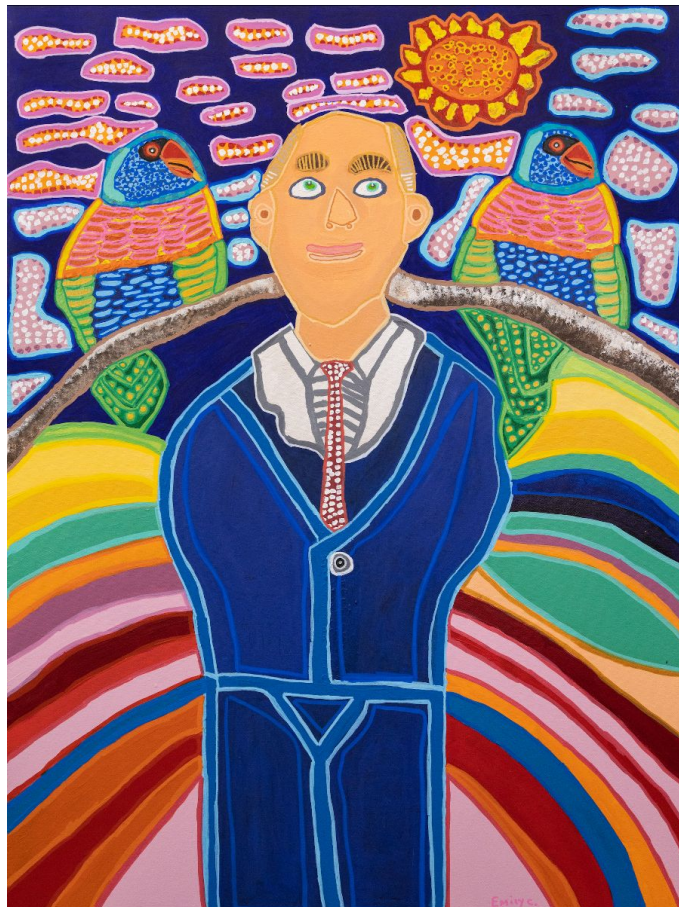
Emily Crockford, Trent Zimmerman watching the sun with all the clouds and the lorikeets are singing , from Salon des Refusés 2021