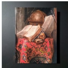
Book: Treasure Ships exhibition catalogue $60.00