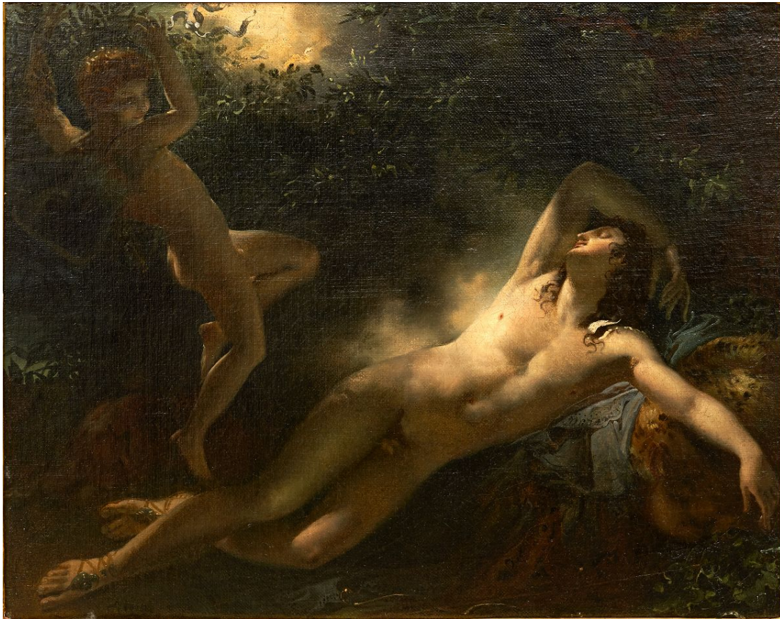
Anne-Louis Girodet (France 1767-1824), Sleep of Endymion , c.1810, oil on canvas, 25.5 x 44.5cm