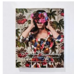
Book: Blooms and Brushstrokes $55.00