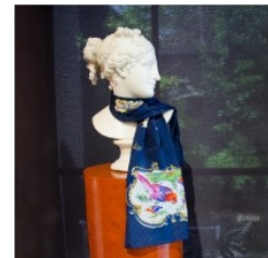
Scarf (Worcester) $50.00